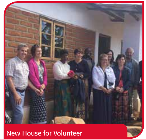
New House for Volunteer