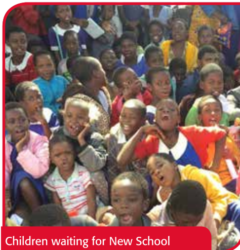
Children waiting for New School