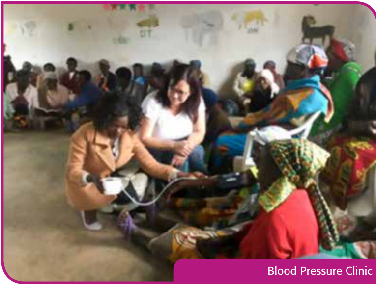
Blood Pressure Clinic