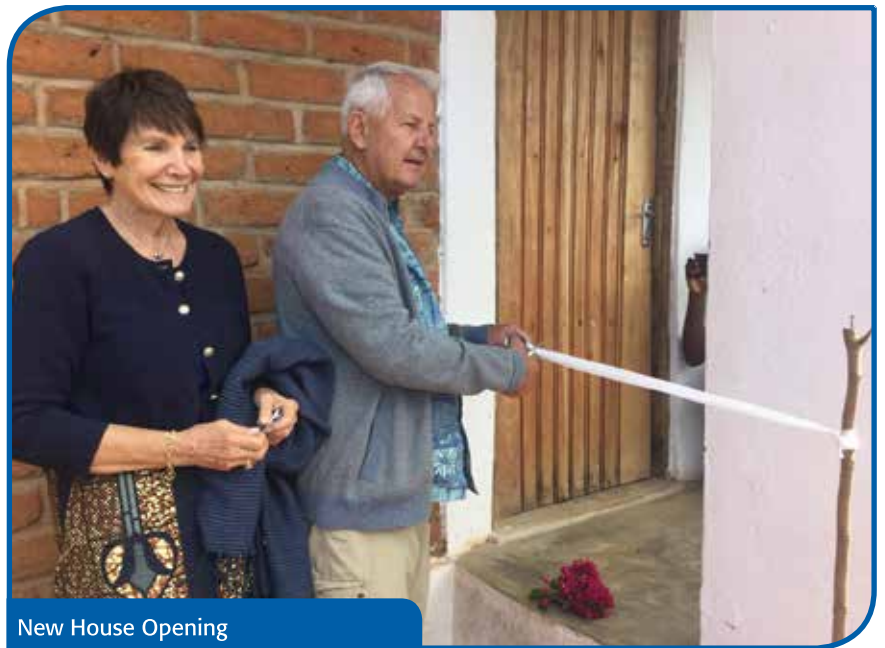
New House Opening