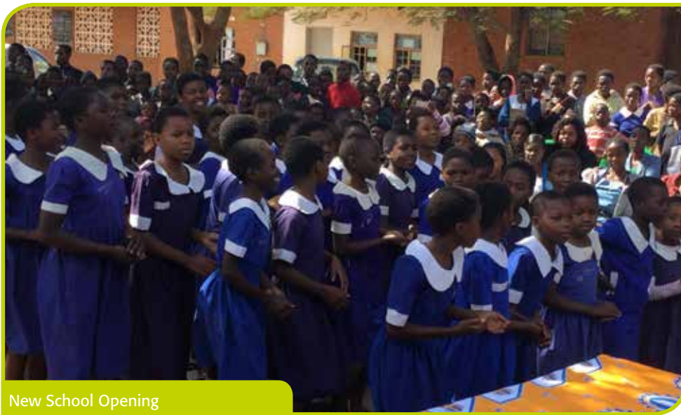
New School Opening